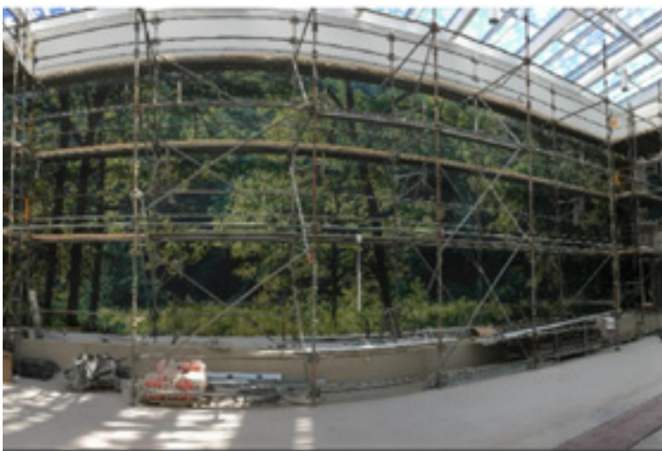
Beacon Children's Hospital, South Bend, Indiana Installer: Perry Acoustics, Inc.

CLIPSO® can print virtually any image, whether it is from our online image collection, a stock image, a museum masterpiece or it is something you've created with a camera or paintbrush. Since most CLIPSO coverings are printable, the possibilities are endless with CLIPSO.