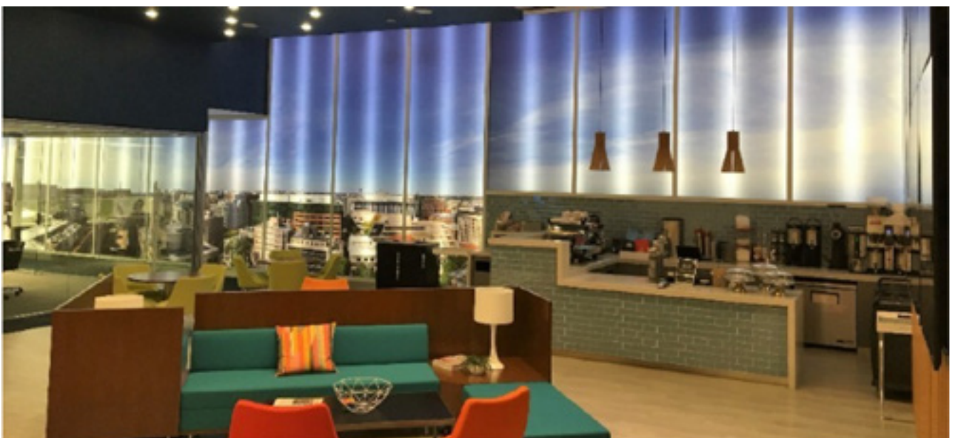
Corporate Break Room, Washington DC Installer: Fabric Wall Concepts - Architect: MGAD Architects