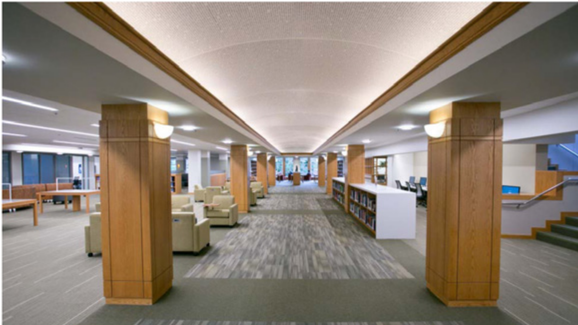
Bishop Library, Lebanon Valley College, Annville, PA. Architect: Breslin Ridyard Fadero Architects. Installer: Unique Construction. Independent Sales Rep: S & S Resources, Inc. CLIPSO materials: 495 AC Straw fabric, custom printed. P-CC profile. LA 53 acoustical batting.

It's September, and you know what that means; the days get shorter, the nights grow colder, and the kids go BACK TO SCHOOL!