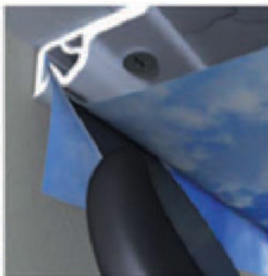
2. Tuck Fabric