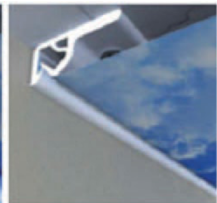
3. Stretch and Trim