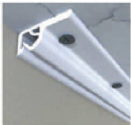
1. Attach Profiles