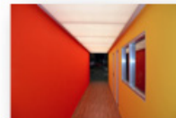
Torsion Spring Panels