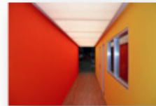
Torsion Spring Panels